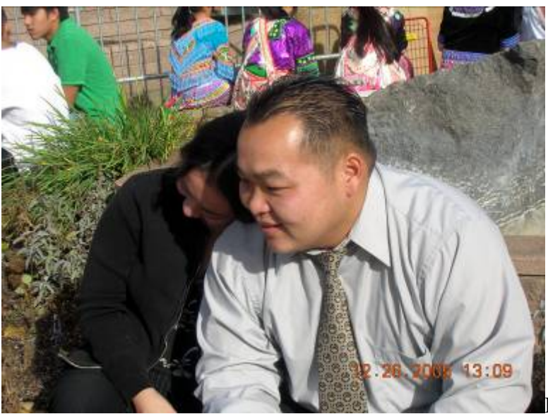
Behind no one's back.