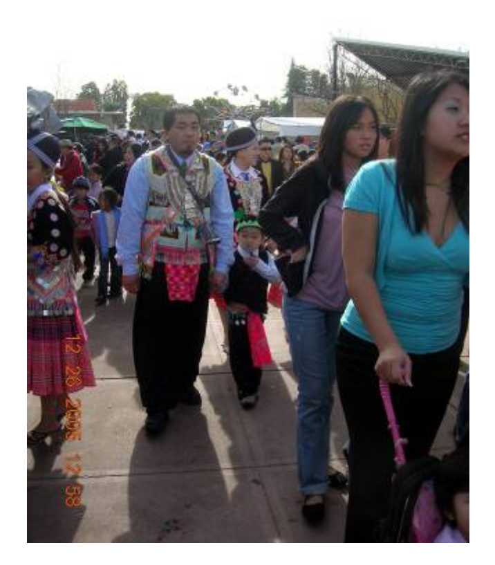
Checking out the shops.