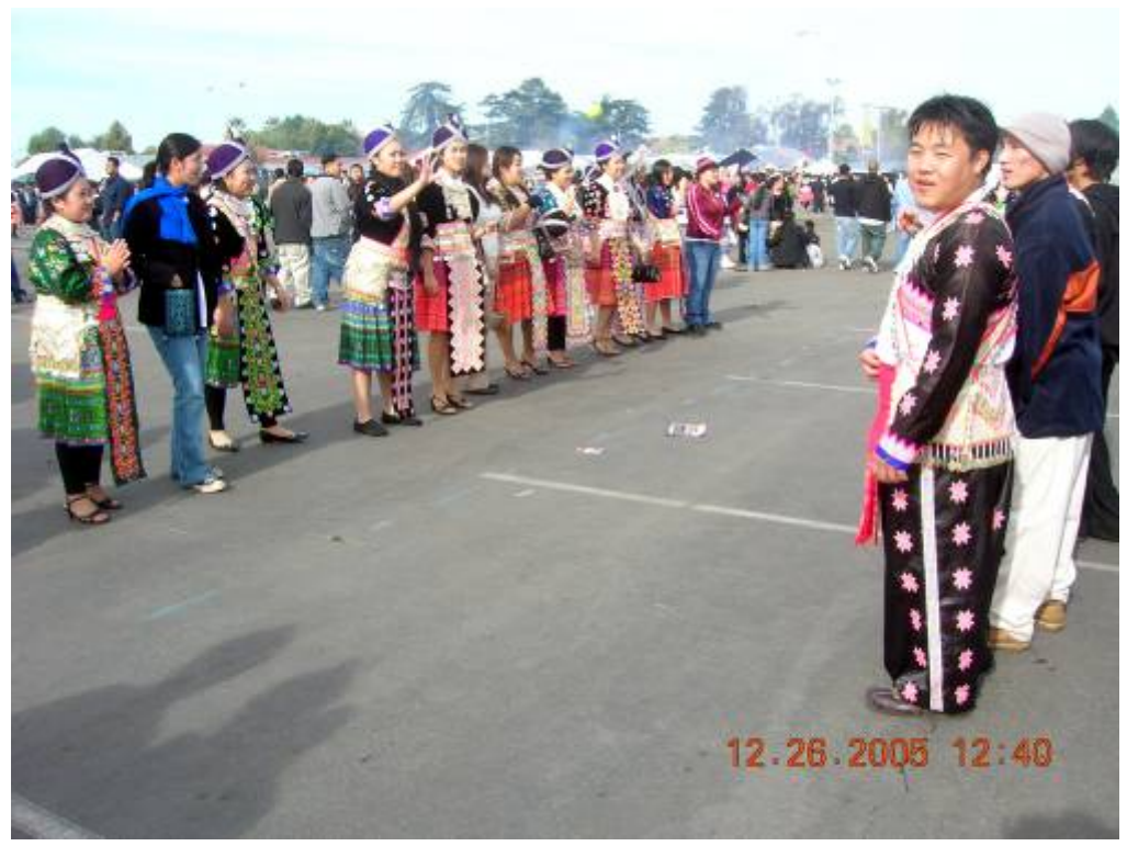
Keeping the old tradition – the Ball Tossing of the young. Most women wear Hmong costumes, but very few men wear them.