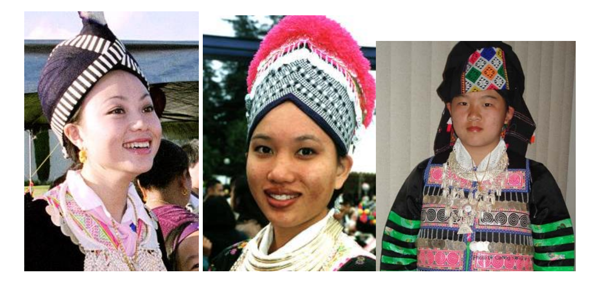
Three very popular costumes of the late 1970s and early 1980s belong to the Hmong in Xieng Khouang, Luang Prabang and Sam Neua as shown in these three photos (Left to right).

Costumes Hmong youth clothing worn to the New Year ball tossing from 1980s to present.