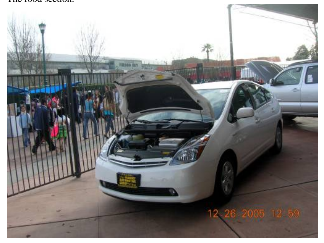
Toyota Corporation came to the Hmong New Year as well.