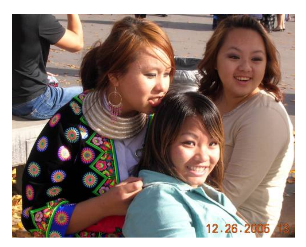
Born in America.