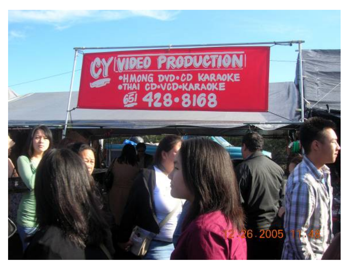
The Video Corner.