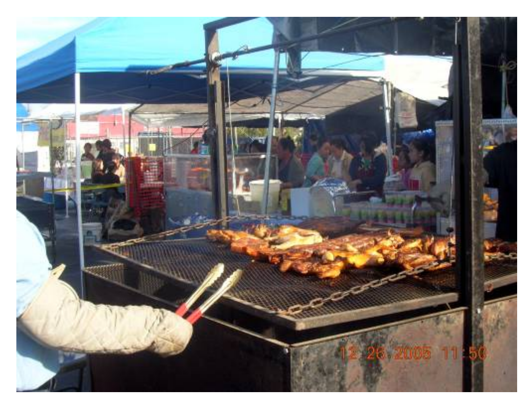
The food section.