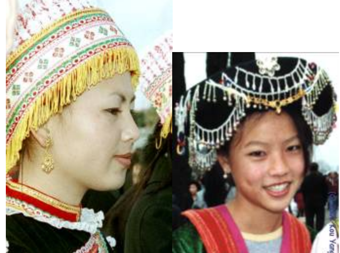
2002: Examples of Borrowings from other ethnic groups.