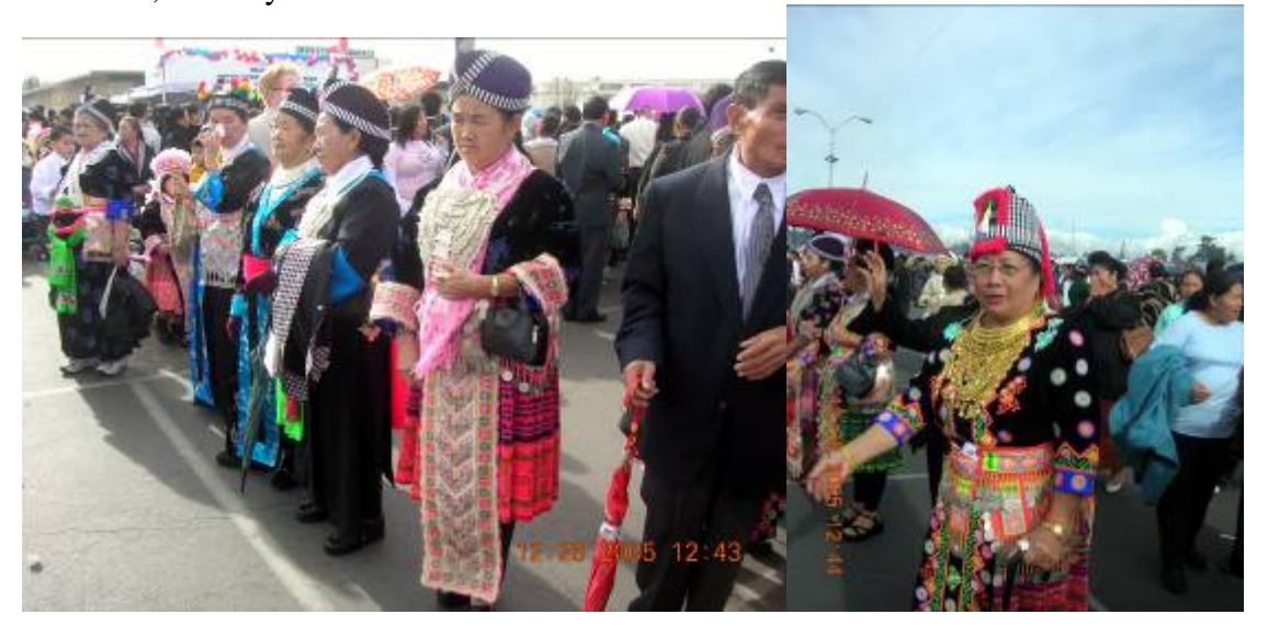
Creating new traditions – The ball tossing of the middle-aged.