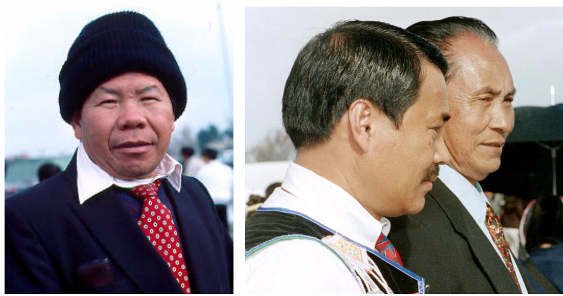
Left: A Hmong man in a western suit (1982). Right: One man with a Hmong vest, the other wears a western suit. There is a noticeable change in how they wear western suits.

Costumes Hmong youth clothing worn to the New Year ball tossing from 1980s to present.