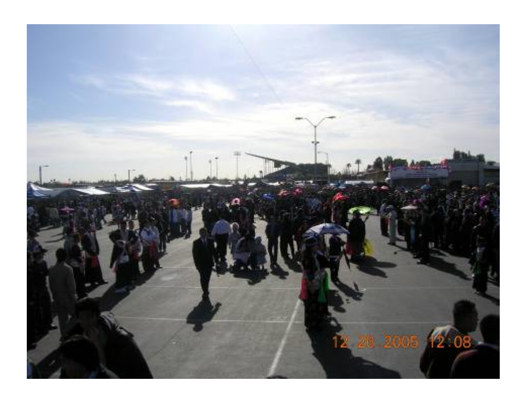
Into the Fairgrounds.