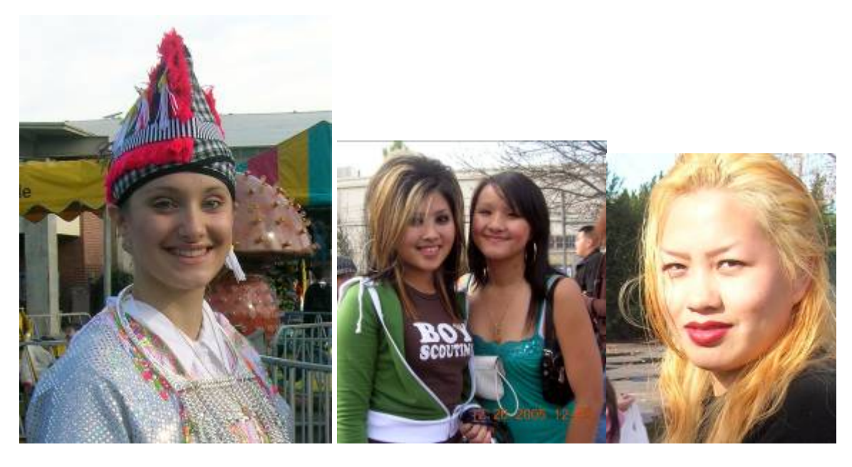
The future begins today.