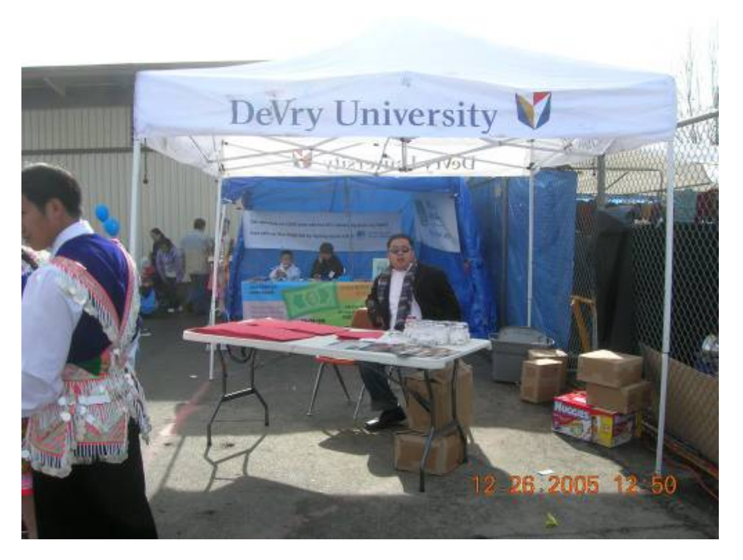
The University Recruitment Alley.