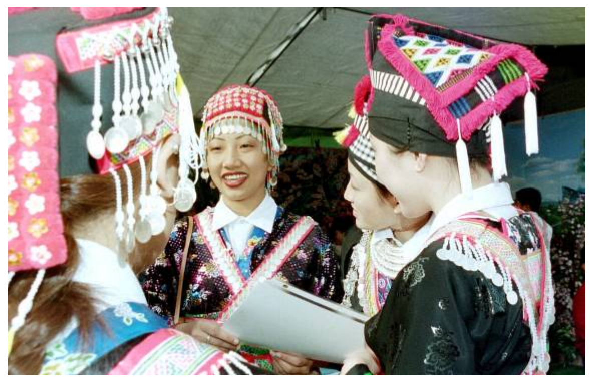
Post 2000: This photo is an example of creativity and the combination of costumes from the Hmong of different areas of northern Laos.

Below are photos of cultural, commercial and other activities from the 2005-06 Hmong Fresno New Year.