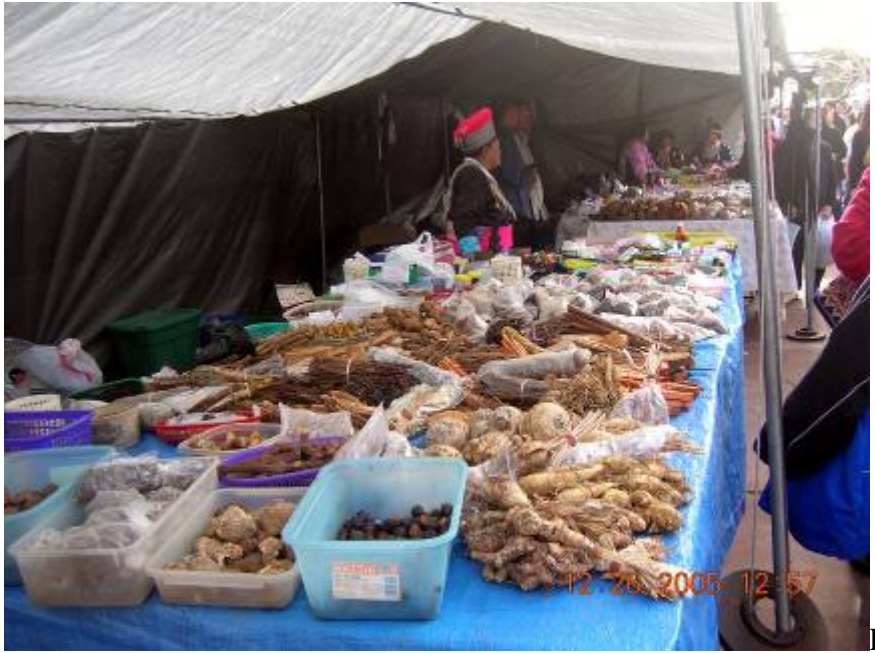
Herbal medicine area.