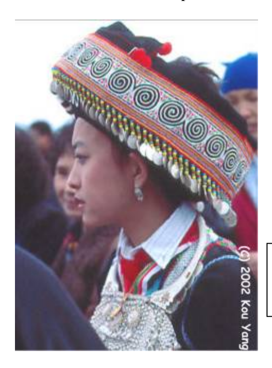
1991: This head piece evolved from Hmong Sam Neua and the necklace is from Hmong Xieng Khouang.