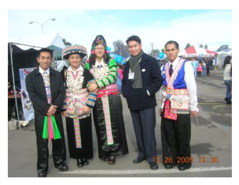
The booth of the Hmong Student Inter-Collegiate Coalition.