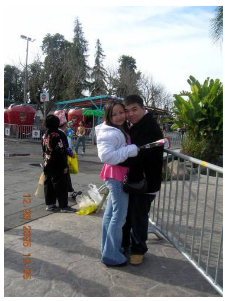
Behind grandma's back.