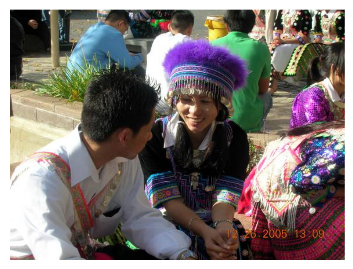
Privacy: Koj thiab Kuv - Toi et Moi.