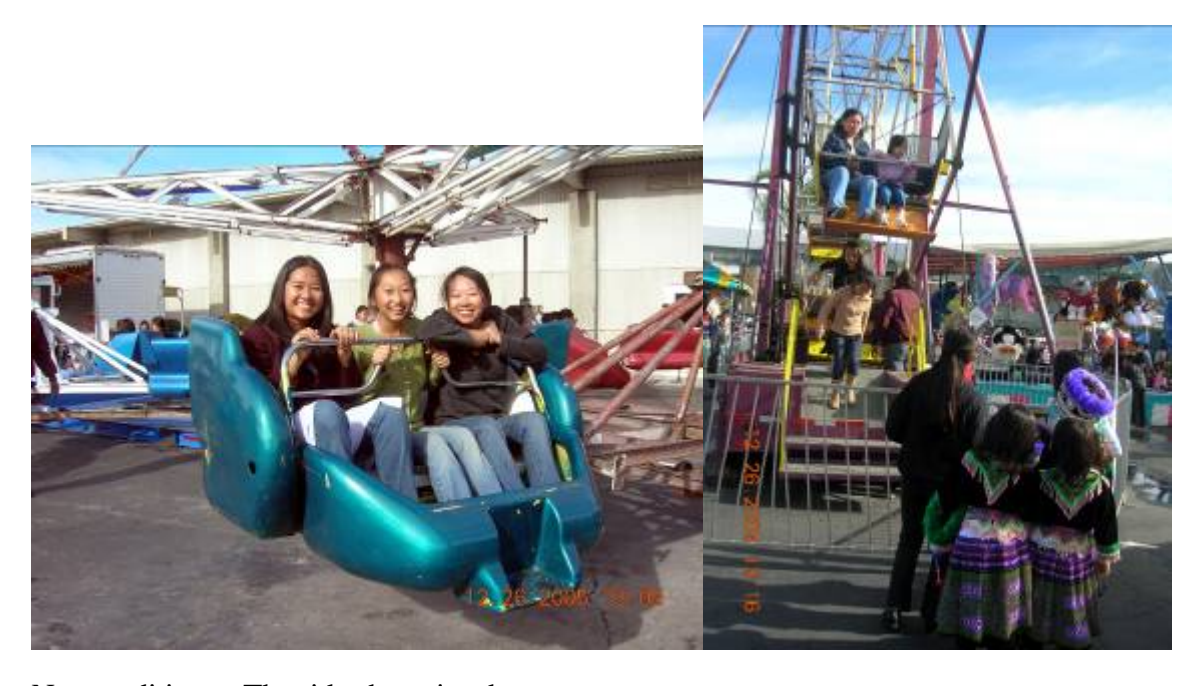
New traditions - The rides have just begun...