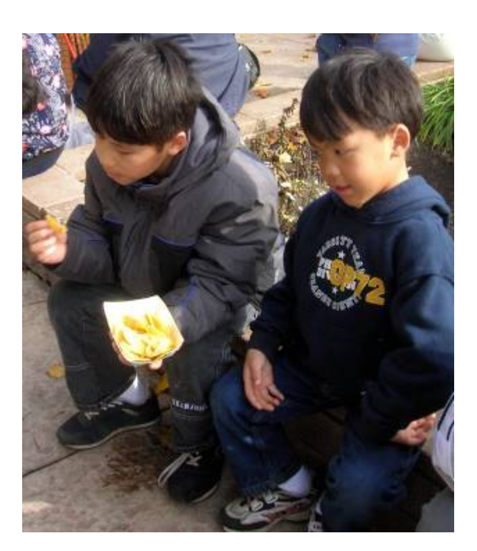
Multi-cultural Food Preferences: Hmong children love nachos, too