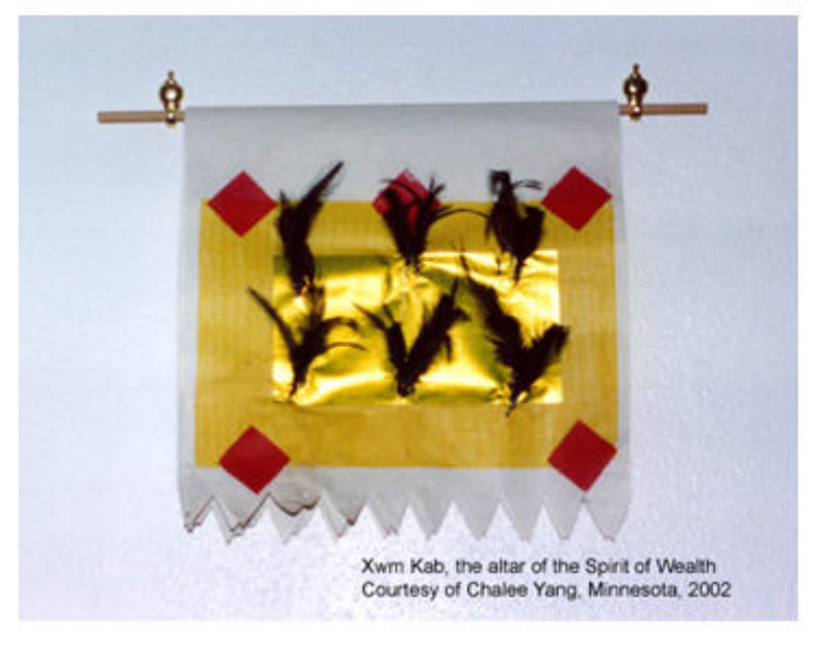
Picture #9: The Altar of the Tutelary Spirit of Wealth or Dab Xwm Kab