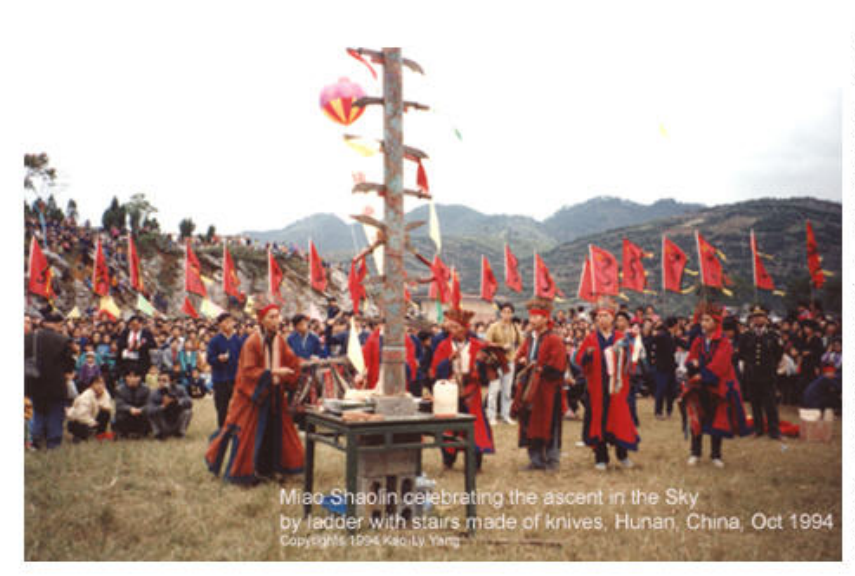
Picture #3: Presence of Buddhist Shaolin Monks in Miao Kuoxiong rituals. The province of Hunan, heartland of Miao people, was the home of the first Shaolin temple: the Chinese Emperor Tuoba Hong 拓跋宏 had enacted an edict to establish the Shaolin Temple for the Great Buddhist Monk of the West, Bodhidharma, founder of the Zen Buddhism in the 6th century A.D.. Seeking Buddhist monks help for illness, sterility, should have been the procedures for Miao of long ago. Lady Kaying, Buddhist divinity, might have been incorporated in the Hmong system of belief at that time. Photo taken during the Miao "International (Hmong) Culture Symposium & Economic and Trade Cooperative Conference", Hunan (China), October 1994.

no visible trace of Buddhist practices in the Hmong beliefs of the Hmong groups who migrated to Southeast Asia in the Middle of the 19<sup>th</sup> century, it may be explained by the loss of many cultural practices due to long social isolations of the sub-ethnic groups, and economic struggles for their survival in the hostile mountains of Southeast Asia. These experiences impoverished the ethnic group and fragmented its beliefs, culture and languages while at the same time substantially varying them as they intermingled with the beliefs, cultures and languages of other ethnic groups or societies encountered in their migration.